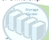
Data Center Columbus