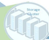
Data Center Oklahoma City