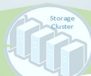
Data Center Montgomery